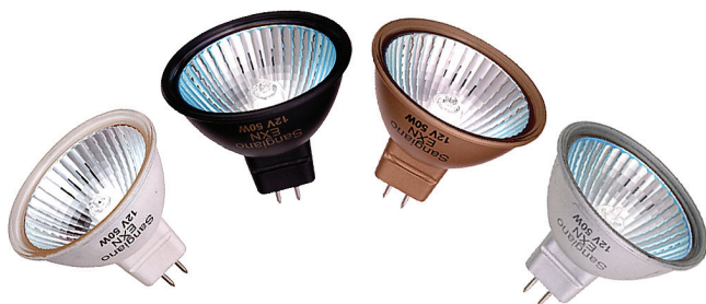
DICRÓICA COPO CBODRIDO